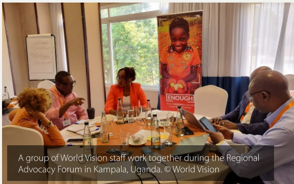
A group of World Vision staff work together during the Regional Advocacy Forum in Kampala, Uganda.

The latest meeting, held at the start of this month, detailed hunger-related social listening efforts from January to March 2024. It was encouraging to note the increase in World Vision's share of voice in the hunger space. From January to March 2024, it increased threefold from its baseline of 2.7% to a remarkable 8.8%. This change can be attributed to the ongoing thought leadership efforts within GHR and the ENOUGH campaign.