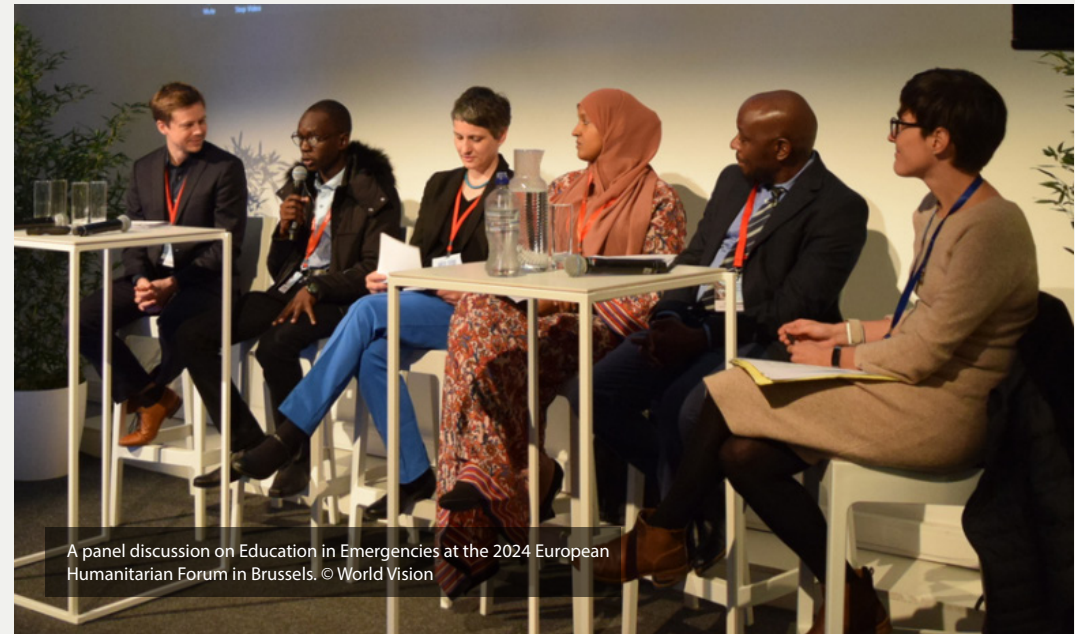
A panel discussion on Education in Emergencies at the 2024 European Humanitarian Forum in Brussels.