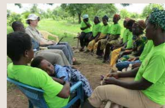
Image 3: Focus groups in Yindure (top), Wakii (centre) and Tongo-Beo (bottom)

Key informant interviews were held with people in key positions in the community to gain deeper understanding of changes, stakeholder participation and different perspectives they may have.