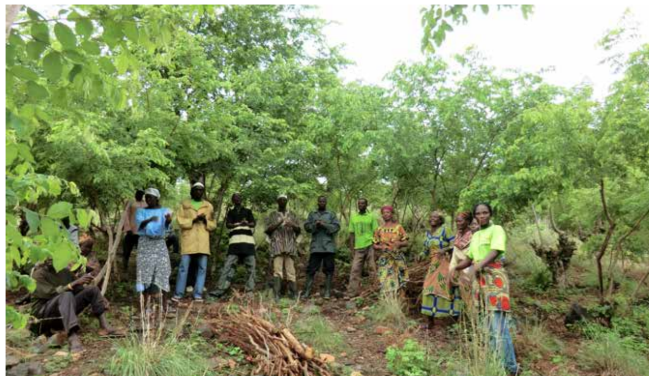
Image 10: Wakii village: Lead group members shelter from the sun in the community-managed FMNR forest site

FMNR is often promoted for its ability to provide rural communities with timber and improve arable soils. In this study, FMNR's contribution to livestock health, psychosocial wellbeing and household access to "wild" consumables such as indigenous fruits, traditional remedies, bush meat and construction materials (thatching and rafters) also created significant value. Yet, because these benefits are not easily measured in economic terms, they may have been invisible or under-valued in previous studies of FMNR compared to more tangible outcomes such as provision of firewood, soil improvement and crop protection.