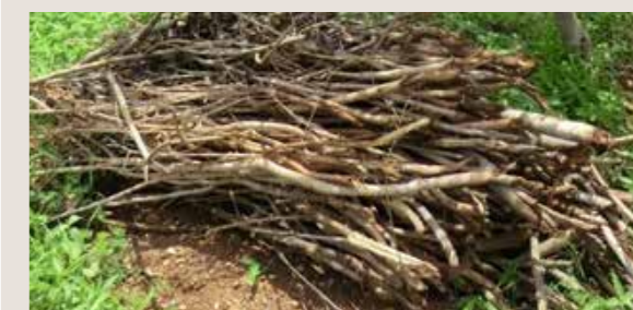
Image 4: Yameriga village: Firewood is bundled next to one-year-old regrowth in FMNR forest

The findings highlight that although FMNR is often introduced on the grounds of improving arable soils and crop production, these gains were secondary to the value of natural assets and availability of consumables enhanced by FMNR.