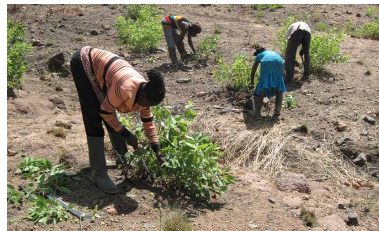
Image 8: Wakii FMR Group members selecting and pruning regrowth at the project initiation

Furthermore, according to Social Ventures Australia Consulting, “the application of the SROI principles requires judgements to be made in areas where there are few definitive answers or standards to use”. The treatment of valuing and discounting and spirit of conservatism in calculations means that some practitioners will under-claim more than others. The SROI ratio is just one aspect of the community’s and the project’s story of change.