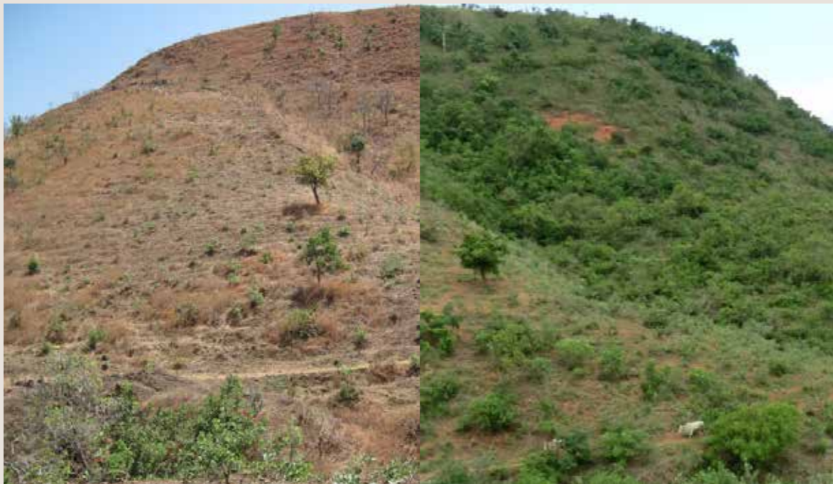
Image 1: Community-managed FMNR Site in Yameriga: at baseline and end-of-project