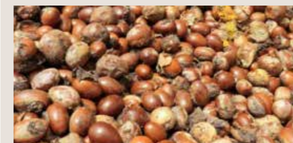
Image 5: Shia village: Shea nuts harvested for processing into butter