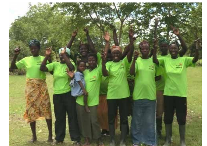
Image 2: Tongo-Beo village: Lead FMNR group women in front of several coppedes after two years of FMNR regrowth.