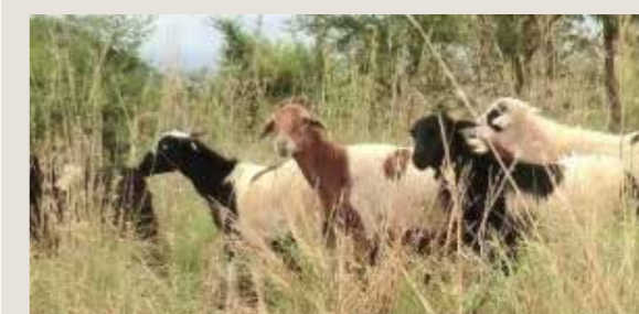
Image 6: Wakii village: Goats benefit from perennial grass supply due to FMNR sites and elimination of burning