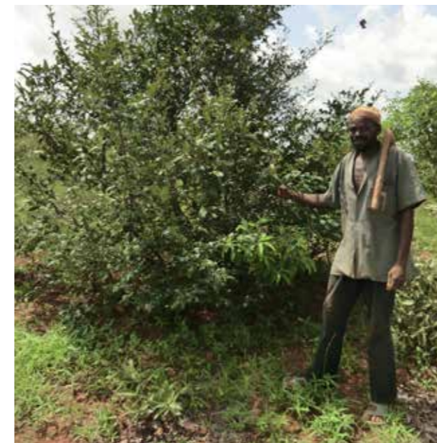
Image 11: Yameriga farmer shows off FMNR regrowth beside his field.

Sincere thanks go to the World Vision Ghana staff from the Talensi Area Development Program and Upper East zonal office, who gave their time and talent to providing reality checks and insights into plans and turned plans