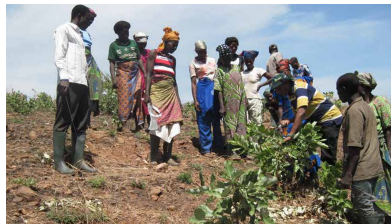
Image 9: Yameriga: In Year 1, WV staff demonstrated the FMNR pruning technique.