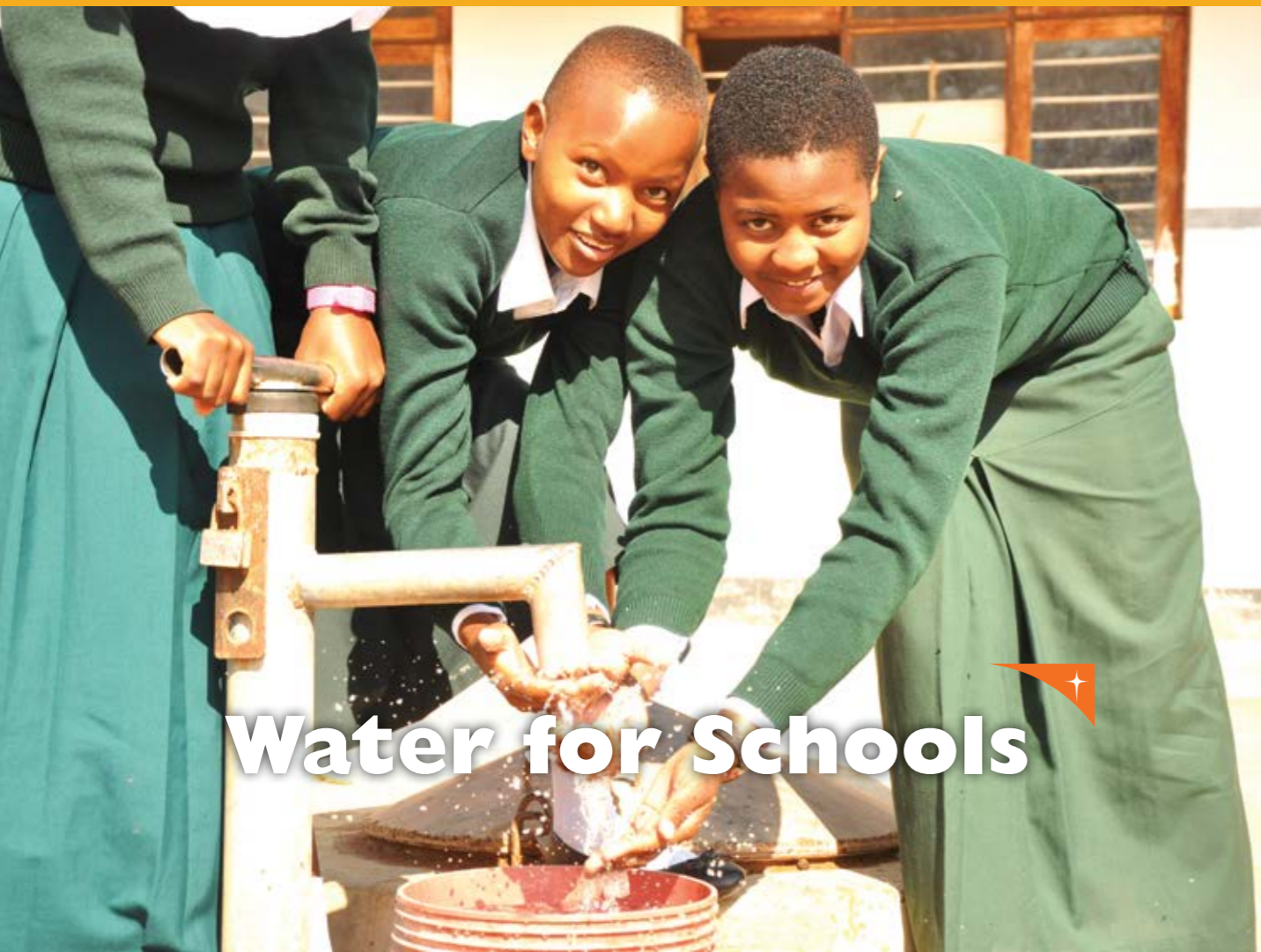
Water for Schools