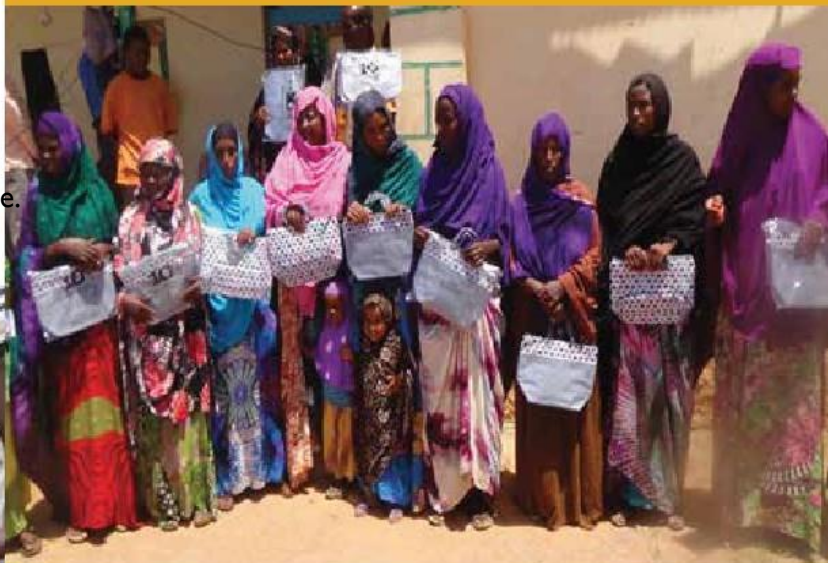
Somaliland: Fistula survivors and women committees receive bags