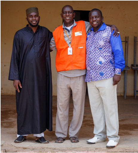
Faith leaders gather in Beledougou Area Programme, Mali, to develop common messaging around WASH for their communities.

✦ 6,144 faith leaders participated in WASH programming