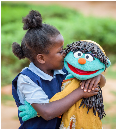
Raya encourages children around the world to be healthier and happier through improving sanitation and hygiene practices.