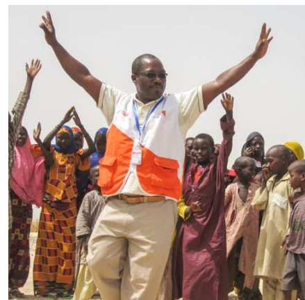
Child Protection team interacting with children in Baga Sola, Chad, May 2017.