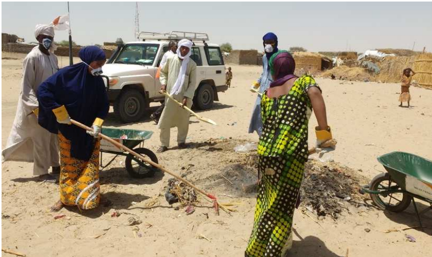
Group of community members cleaning the streets of quartier 5 in Kablewa in Diffa on 28 th May 2017.