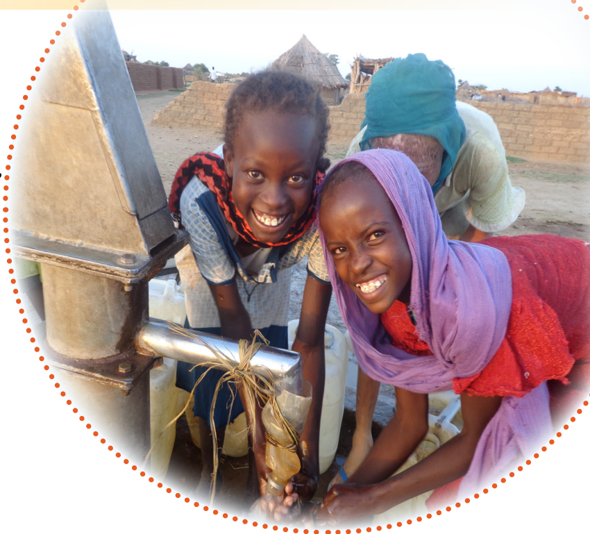
Children in South Darfur fetch water at a facility constructed through support from World Vision

Use of improved drinking water sources: 50% (WHO/UNICEF Joint Monitoring Programme 2012)