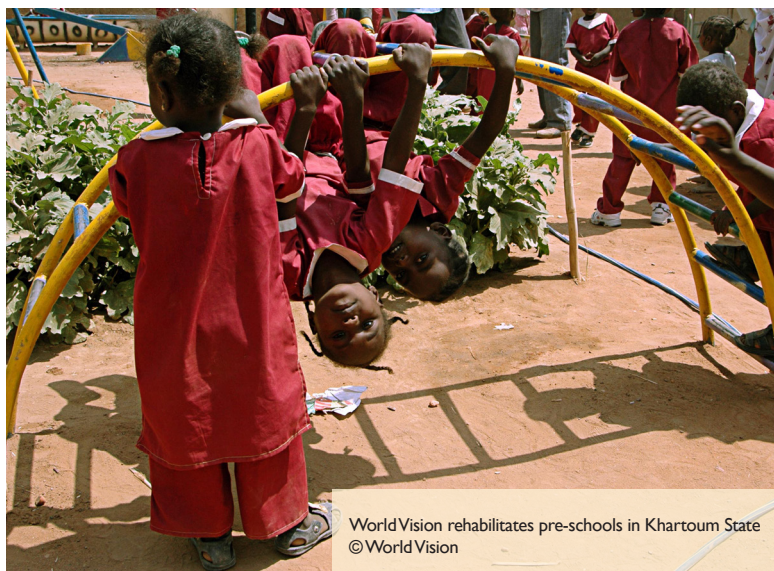
WorldVision rehabilitates pre-schools in Khartoum State

World Vision works to ensure children live in an environment where they are cared for and loved. Our programmes aim to prevent and respond to abuse, neglect, exploitation, and violence against children and youth, ensuring they are nurtured and live in a safe environment. We provide child-friendly spaces in camps where children play and participate in storytelling, dancing and learning activities. Child rights awareness campaigns are another way we help communities build a safe environment for children.