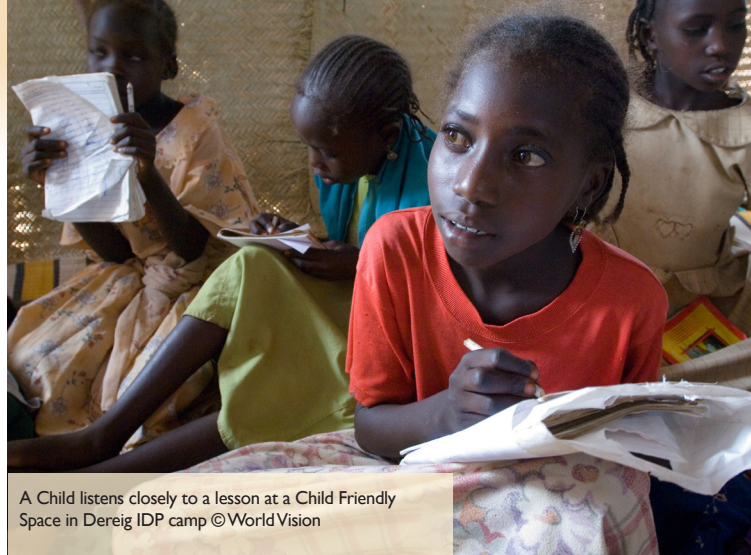
A Child listens closely to a lesson at a Child Friendly Space in Dereig IDP camp

GDP per capita: USD 1276 (Human Development Report 2012)