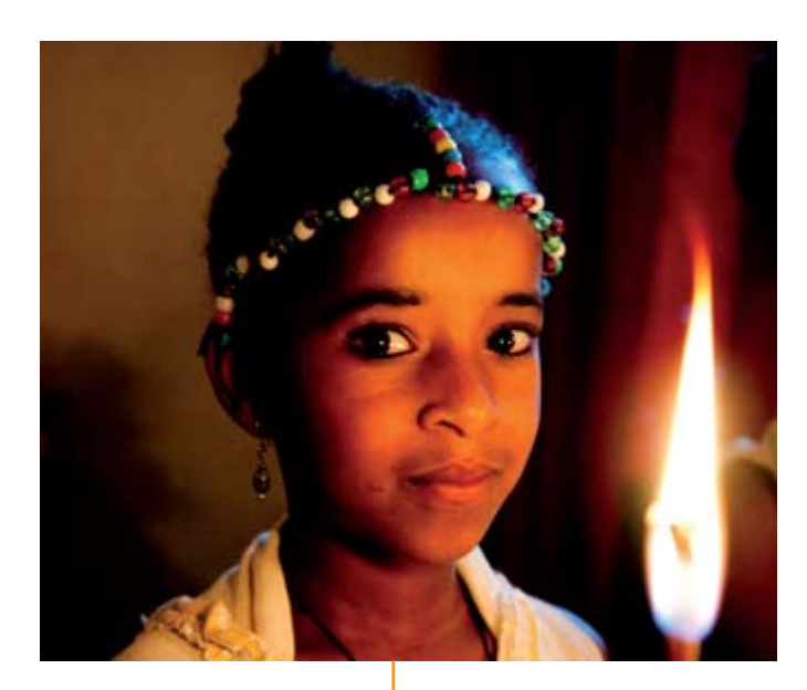
A girl takes part in a candlelight vigil as part of a community group "The Hope and Light Association" that advocates to minimize the stigma faced by people living with HIV and AIDS.