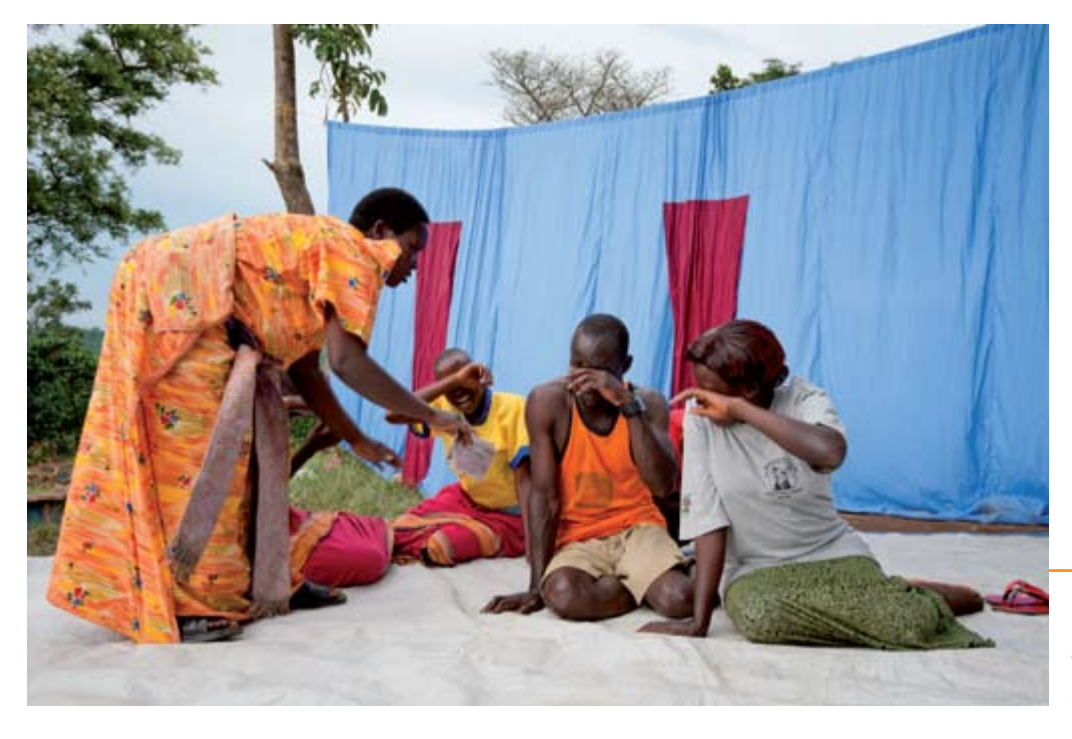
Students at the school in Kasangombe, Uganda, perform AIDS educational dramas