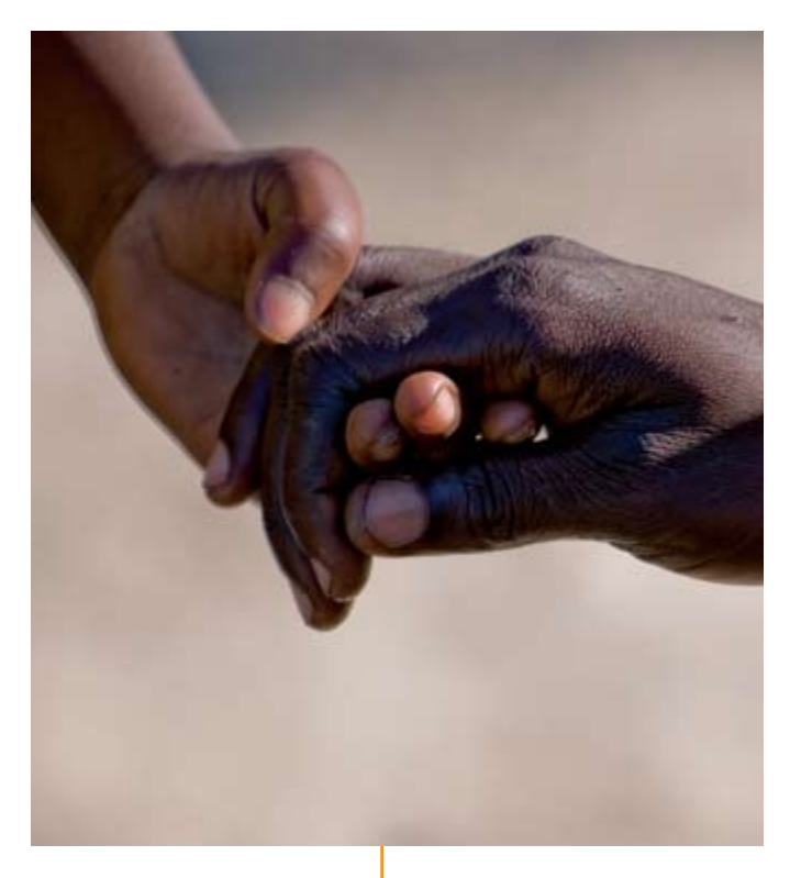
Orphan Enoch with caregiver Roderick. Caregivers provide essential emotional, social and practical support to children and their guardians.

Mirroring the results of 2005, the recent survey found that OVC were much less likely to have their three basic needs met (identified as food, education and shelter).<sup>30</sup> Given the many challenges faced by OVC households, only 28% of OVC had these basic needs fulfilled compared to 51% of non-OVC. The contrast between the two was even starker in the adjacent communities where only 14% of OVC were considered to have adequate food, education and shelter.