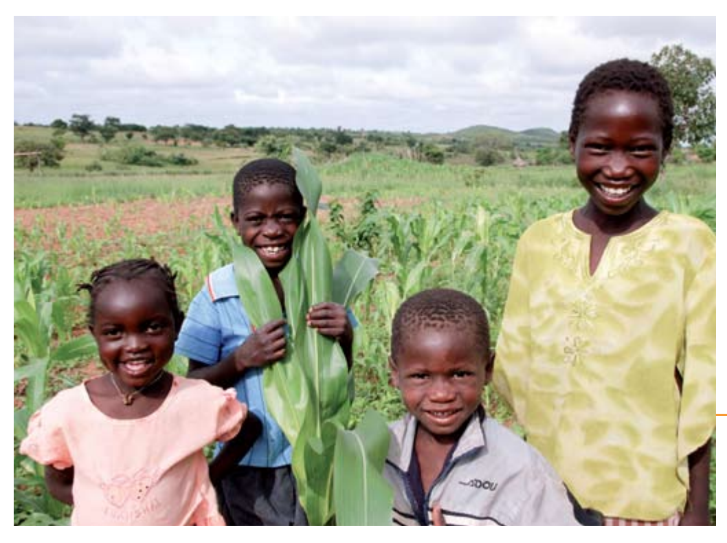
These children in Gwembe District, Zambia are now looked after by their 75 year-old grandmother after they lost both their parents.