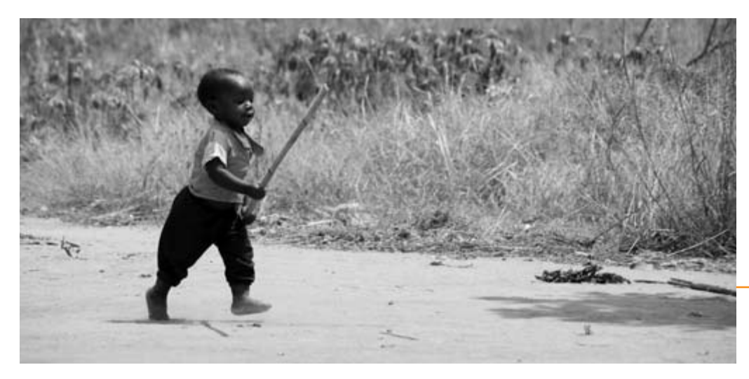
A young child in Mozambique runs with a toy stick.