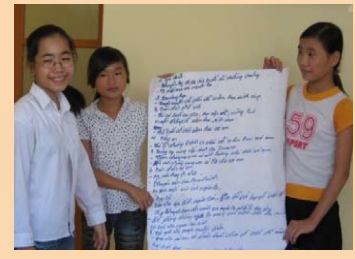
Girls in Vietnam share their ideas on how to end sexual exploitation.