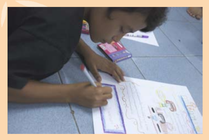
A Thai child illustrates sexual exploitation in the community.

Most of the consulted children and adolescents feel access to adequate information and formal education for themselves and adults is a priority to help protect young people and create safer communities. Governments, non-governmental organisations (NGOs), civil society and the private sector can