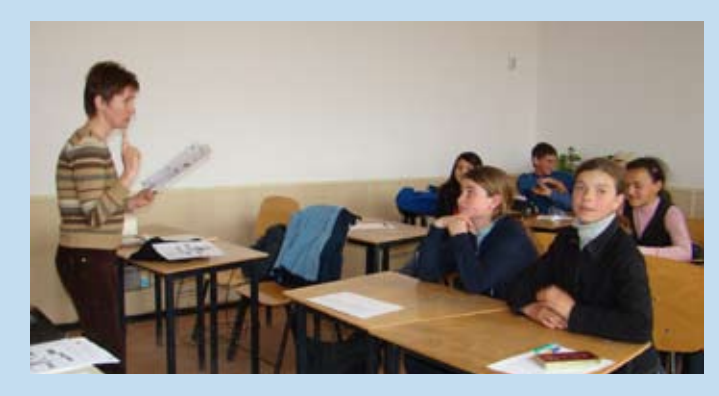
Young people say teachers play a critical role in protecting them from sexual exploitation.

As a child-focused organisation working in nearly 100 nations, World Vision abhors the abuse and exploitation of children and adolescents and undertakes advocacy and programmes to end it. We have been at the forefront of child protection efforts in some of the most difficult contexts. Our experience has taught us that children are key agents of change and transformation in their communities and must be heard and included as equal partners. It is critical that adults, parents, civil society, the private sector and governments listen to the voices of these children and adolescents and act together on their recommendations.