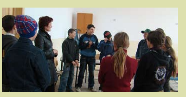
Children in Romania discuss sexual exploitation.