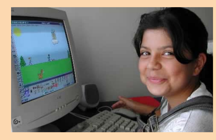
Children around the world want better protection on the internet.

drinking and drug use; and not re-marrying spouses that might rape or maltreat their children." (Cambodia)