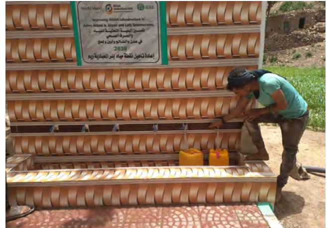
Completed waterpoint in Lahj, 2020