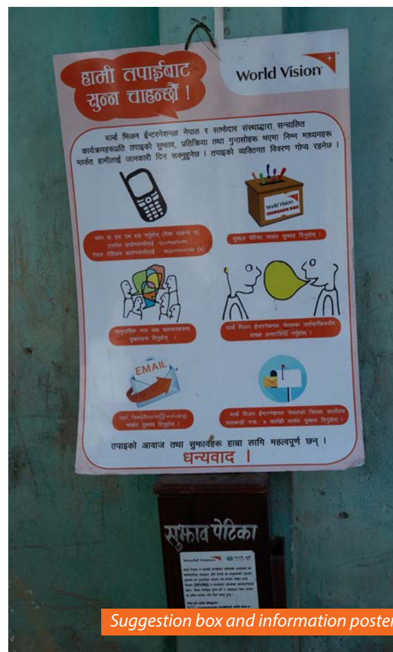
Suggestion box and information poster