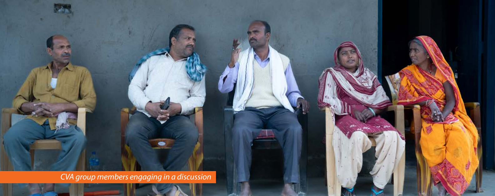
CVA group members engaging in a discussion