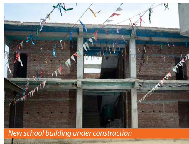
New school building under construction

The CVA group's initiative has significantly improved the management of the primary school. Their initiatives have touched many students' lives and provided an example of how coordination and proactive measures can bring about positive change in education.