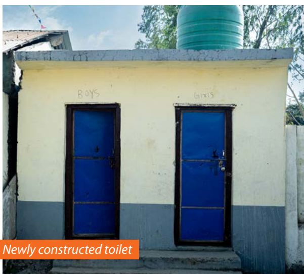
Newly constructed toilet

With the coordination of parents and teachers, the school's learning environment and student regularity have improved.