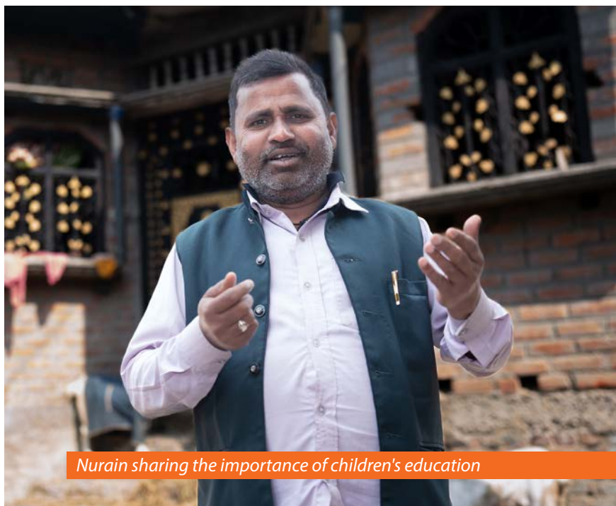
Nurain sharing the importance of children's education

Sikai project has changed the education system in four municipalities of the Sarlahi district of Nepal. The project has improved the education standard and infused a sense of responsibility among parents.