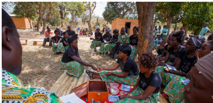
Savings Groups reduce poverty by creating opportunities for members to borrow and earn interest on their saving

Under the Enhanced Livelihoods & Resilience (EL&R) programme, we help small holder farmers gain agriculture skills, restore their environment or natural resource, access financial services to help them participate on a local value chain by financing their small scale enterprises and provide financial literacy to improve their money management skills. World Vision Zambia integrates Gender Equality & Social Inclusion (GESI) across all our Technical Programs including livelihoods and it takes into consideration GESI at all stages of the project cycle (design, implementation, monitoring & evaluation). GESI ensure all vulnerable groups including youths and women take part in project interventions.