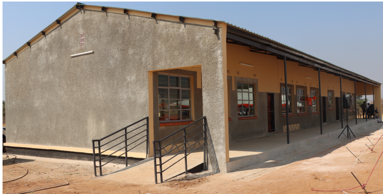
1x3 classroom block at Kanchomba Secondary School was constructed by Cfao Motors and Zanaco Bank in partnership with World Vision under the Strong Girls Strong Zambia campaign.