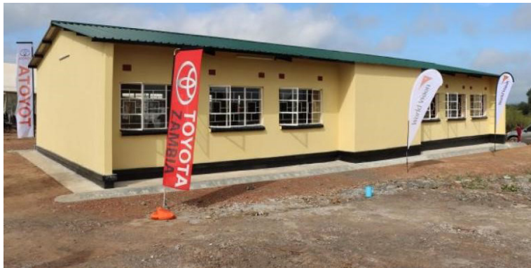
1x2 classroom block at Hippo Community School was constructed by Toyota Zambia in partnership with World Vision Zambia.