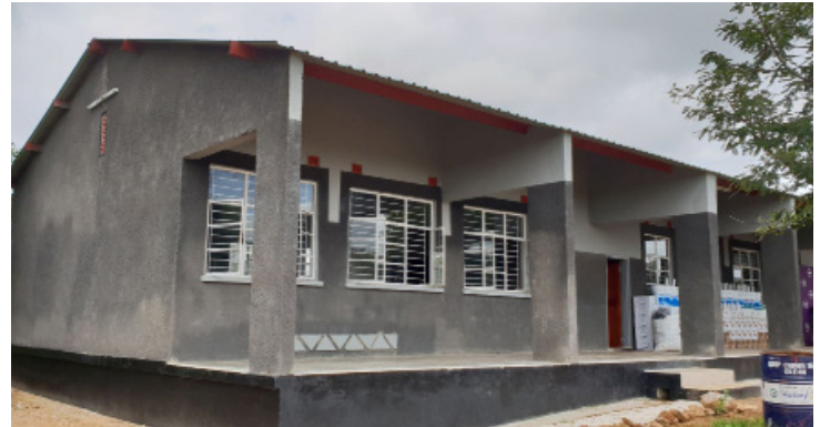
Chipapa Secondary School classroom block in Lusaka Province was constructed by Absa Bank in partnership with World Vision.