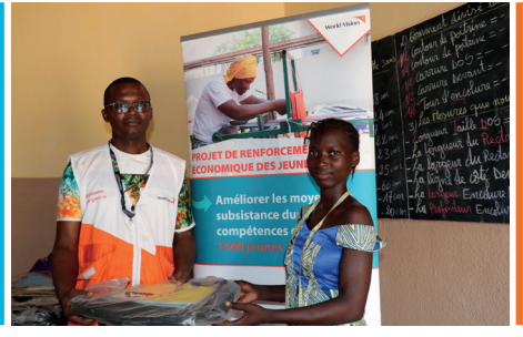
School supplies for young people enrolled in vocational training centers