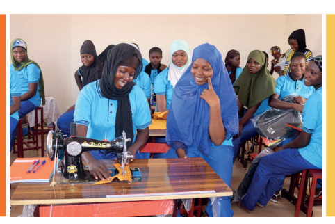
Sewing learners in a hands-on learning workshop