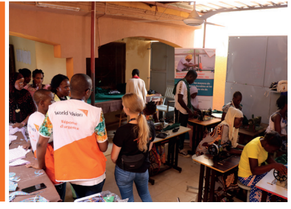
Supervision visit to young people enrolled at the sewing training center