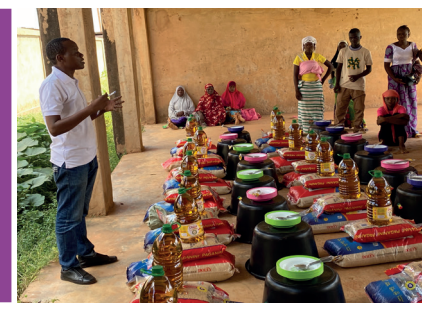
Distribution of installation kits to beneficiaries trained in catering