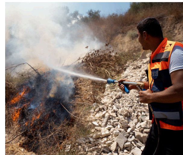
A community volunteer in the central West Bank is trained to use new fire-fighting equipment provided by World Vision

*Advanced first aid kits contains basic first aid material (bandages, antiseptics, etc.) as well as a range of supplies and equipment to address more complex medical situations such as open wounds, severe bleeding, broken bones and other traumas.