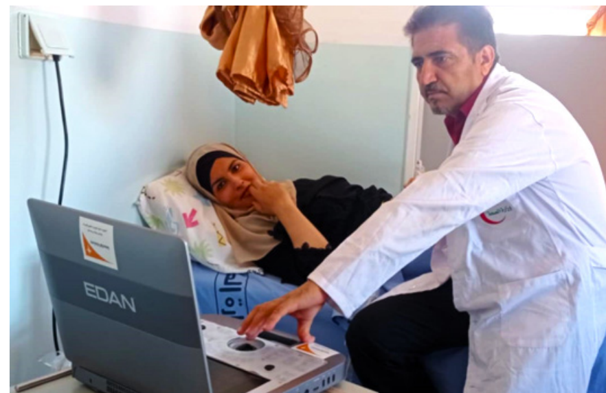
A doctor conducts a prenatal test using a mobile ultrasound machine provided by World Vision in the south of the West Bank.