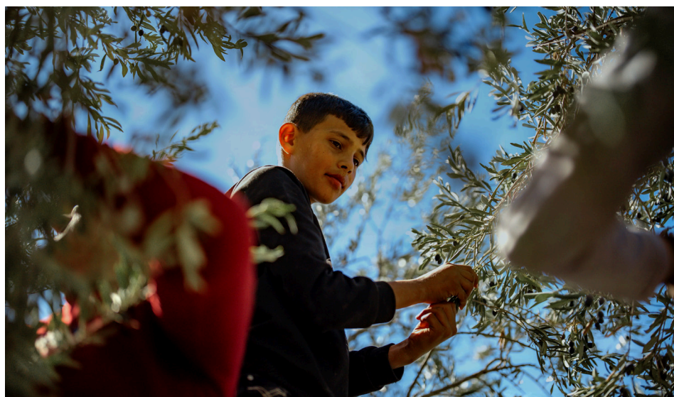
A child takes part in the olive harvest in the south of the West Bank.