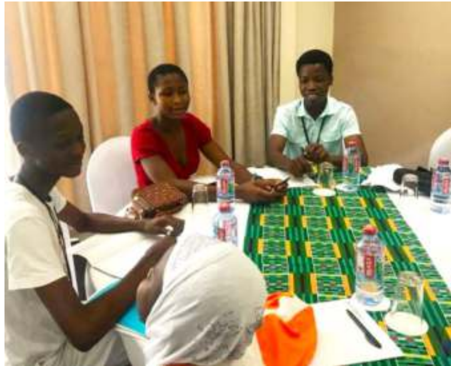
Evans with peers on the extreme right-hand side (in a sea-blue Shirt)

held back by society. Most children were not aware of their rights, reporting and referral systems that can protect them from harm.