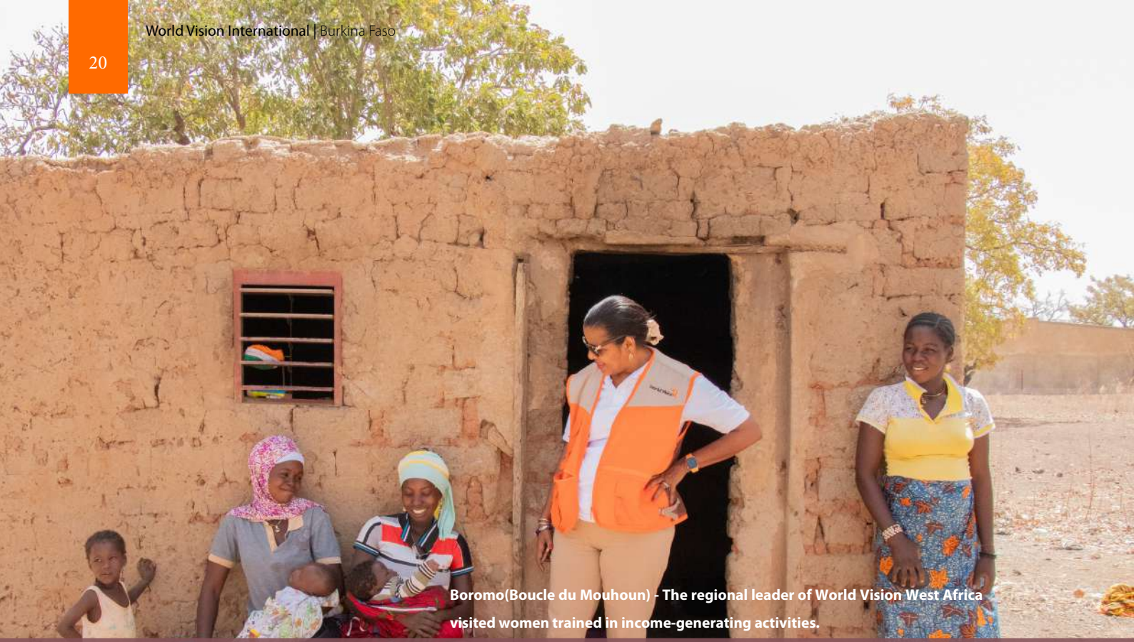
Boromo(Boucle du Mouhoun) - The regional leader of World Vision West Africa visited women trained in income-generating activities.