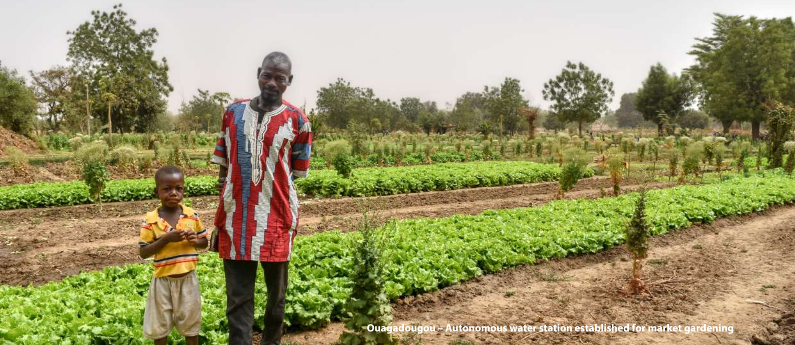
Ouagadougou – Autonomous water station established for market gardening