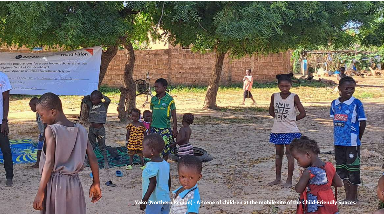
Yako (Northern Region) - A scene of children at the mobile site of the Child-Friendly Spaces.