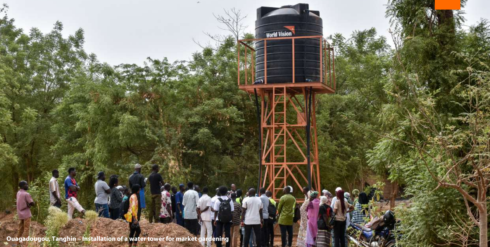
Ouagadougou, Tanghin – Installation of a water tower for market gardening