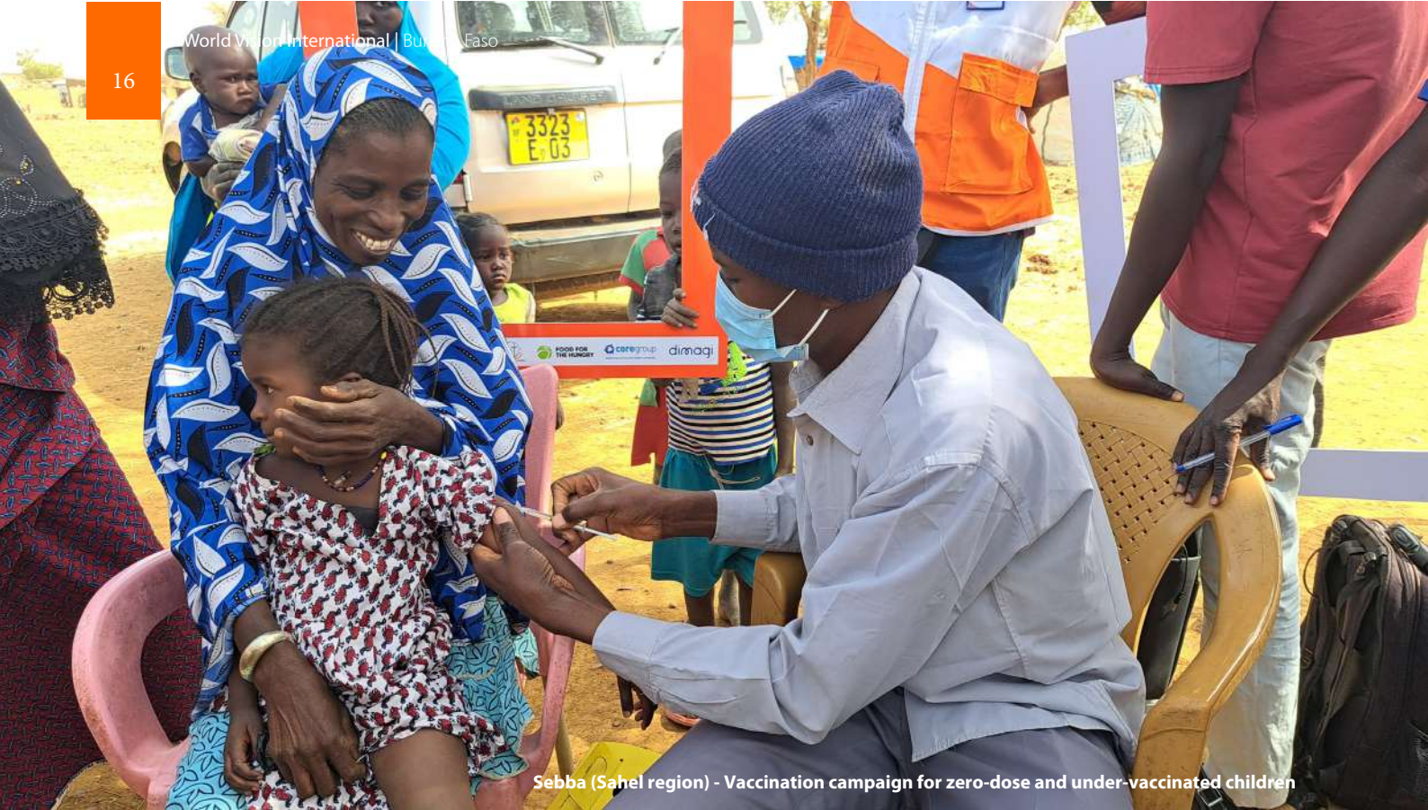
Sebba (Sahel region) - Vaccination campaign for zero-dose and under-vaccinated children