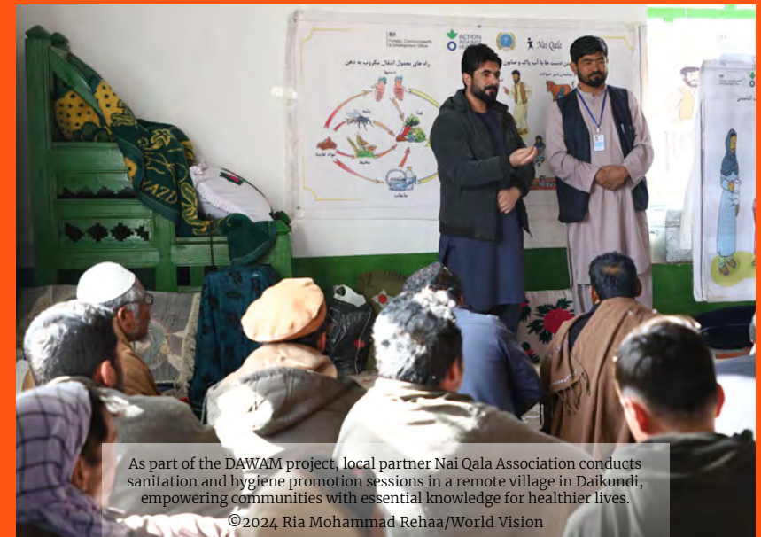
As part of the DAWAM project, local partner Nai Qala Association conducts sanitation and hygiene promotion sessions in a remote village in Daikundi, empowering communities with essential knowledge for healthier lives.

To further strengthen its operational capacity and improve outreach to vulnerable children, WV Afghanistan launched a Capacity Building Project benefiting 492 staff members. Over the course of a year, the initiative enhanced staff performance, boosting their effectiveness in advancing child wellbeing. It also improved collaboration with stakeholders, donors, and communities. Additionally, the project helped staff adapt to organisational changes within Afghanistan's fragile context, fostering innovative thinking and increasing awareness of child wellbeing and care.