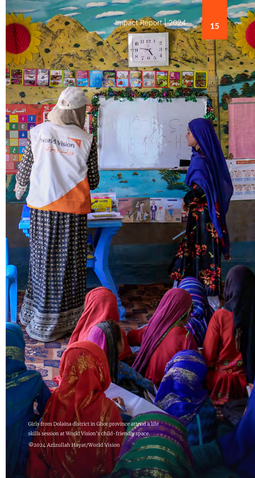
Girls from Dolaina district in Ghor province attend a life skills session at World Vision’s child-friendly space.