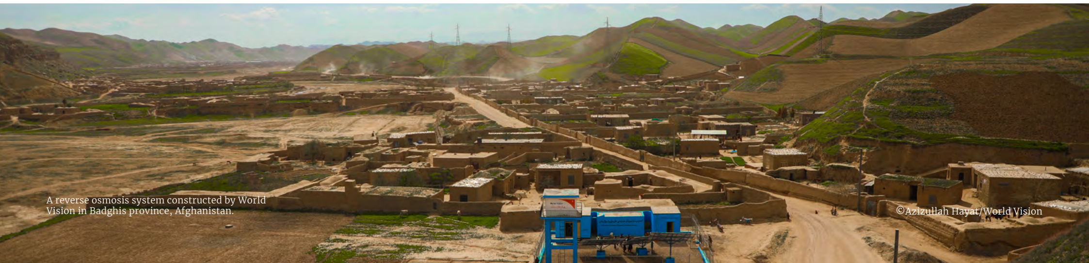
A reverse osmosis system constructed by World Vision in Badghis province, Afghanistan.