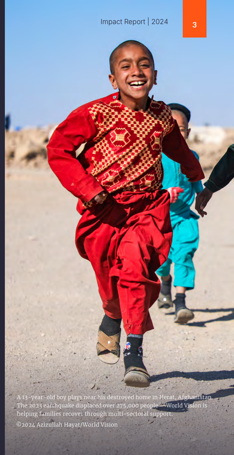
A 13-year-old boy plays near his destroyed home in Herat, Afghanistan. The 2023 earthquake displaced over 275,000 people — World Vision is helping families recover through multi-sectoral support.

National Director World Vision Afghanistan